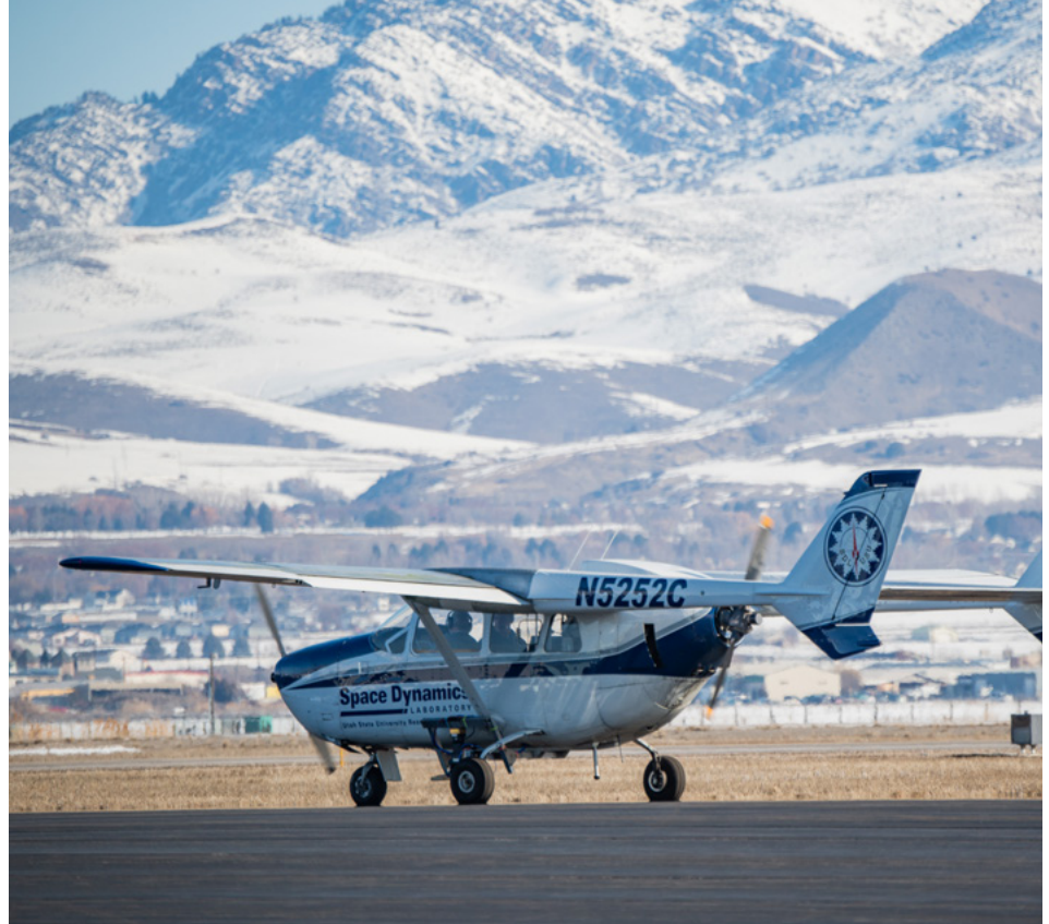
SDL Skymaster aircraft with FLEXSAR

(2) Cessna Skymaster O-2 Manned Aircraft can carry a total payload of up to 450 lbs and 2 kW. It features 22 U of rack space, four wing hardpoints for sensor installation, and inline twin engines for very stable flight. GPS/INS is available.