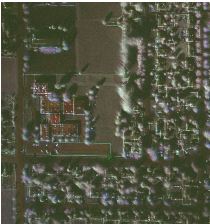
Quad-polarized Ku-band FLEXSAR image