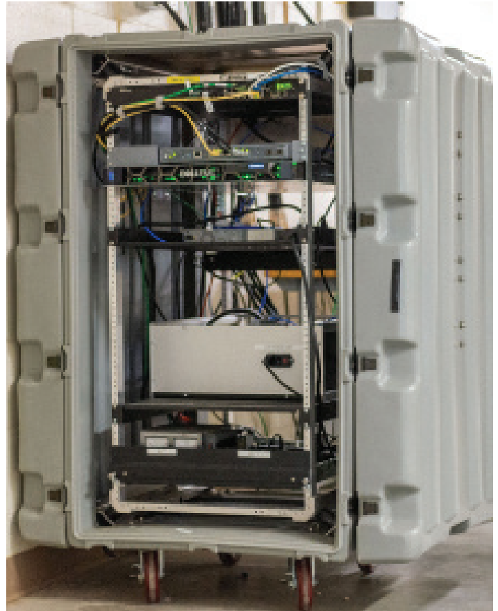
Transportable ground hardware stack.