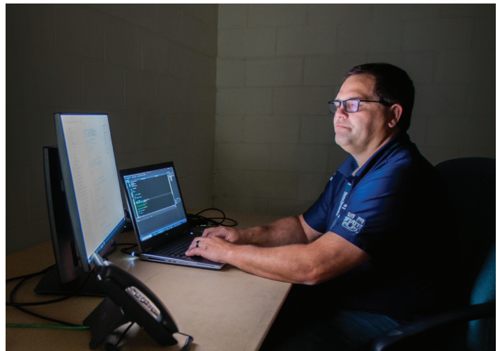
Expert software capabilities and support.