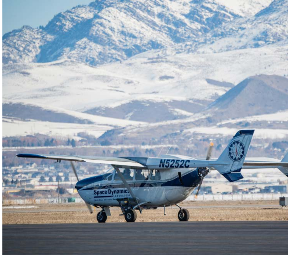
SDL Skymaster aircraft with FlexSAR.

(2) Cessna Skymaster O-2 manned aircraft can carry a total payload of up to 450 lbs and 2 kW. It features 22 U of rack space, four wing hardpoints for sensor installation, and inline twin engines for very stable flight. GPS/INS is available.