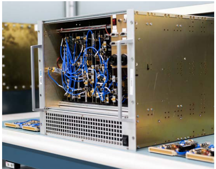
FlexSAR in the VME chassis.

FlexSAR is a low-cost imaging system built on an extensible radio frequency (RF) architecture and supported by software-defined radio for waveform generation and sampling. This system emulates bat echolocation adaptivity in its ability to adjust to evolving conditions and modes. The FlexSAR system is easily modified to accommodate new capabilities and/or changing conditions, with modification timelines measured in weeks rather than years.