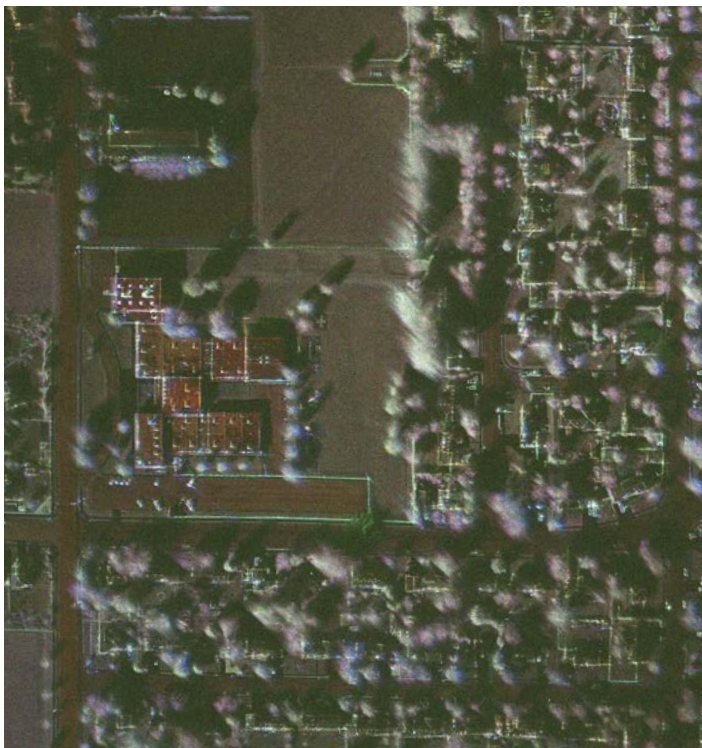
Quad-polarized Ku-band FlexSAR image.