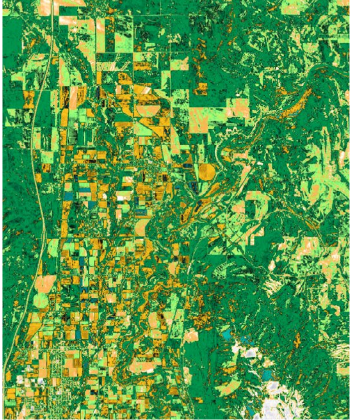
ACORNN enables users to quickly train software to detect new types of objects. This image shows land classified according to use.

The application guides users through the process of creating a labeled dataset, building and training a network, and running new imagery through the trained network. ACORNN networks are based on well-known competition networks.